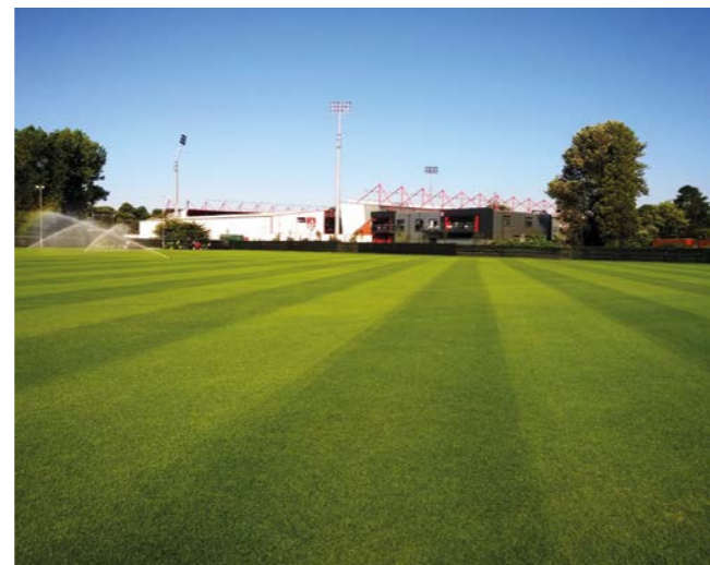
AFC Bournemouth - (Premier League)

AFC Bournemouth, a football club competing in the renowned English Premier League, was convinced by the benefits of Fusion Grass. In 2016, the club replaced the natural grass at their training facilities with our hybrid turf, installing 18,000 m² of artificial grass.